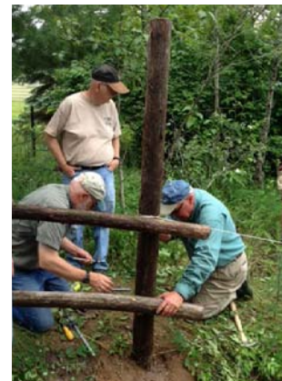
Plans are in the works to improve the Morley Road access.

The battle with Purple Loosestrife continues. Volunteers will be out this summer doing their best to rid the river of this pest.