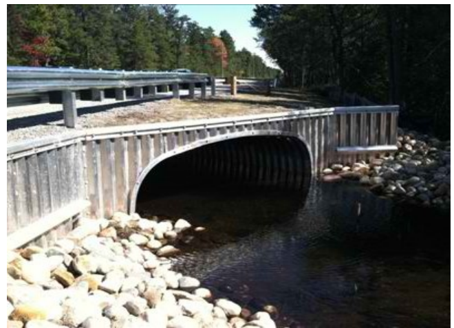
Improved road crossing on Crapo Creek.

ASNBAF has committed $30,000 to Huron Pines in support of the Au Sable Restoration Project, which includes road stream crossing improvements, invasive species removal, small dam removal, in-stream habitat, natural shoreline restoration, native plantings, and habitat restoration and enhancement. Lots of good work for the Au Sable!! We join many other like minded partners who share a mission and passion to protect and improve our beloved Au Sable Watershed. We will keep you advise of progress on this important activity.